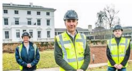
Winslade Park, Clyst St. Mary